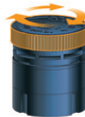
Schedule 80 Risers