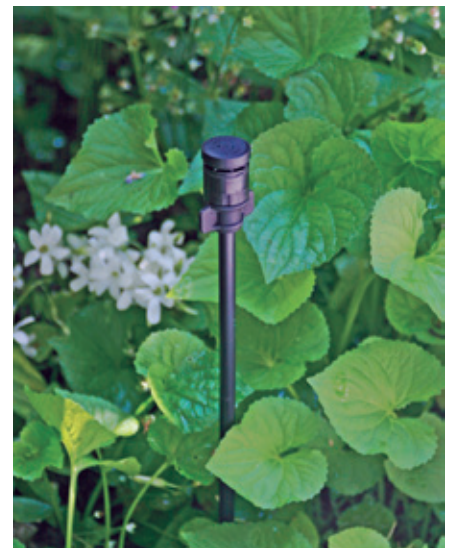
SQ Nozzle Installed on PolyFlex Riser with Nozzle Adapter